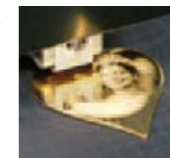
METAZA's diamond-tipped stylus permanently imprints metals and acrylic.

surfaces of acrylic, aluminum, stainless steel, brass, gold, silver, platinum, and on metallic labels. From personalized accessories to awards and gifts — potential applications are as boundless as your imagination.